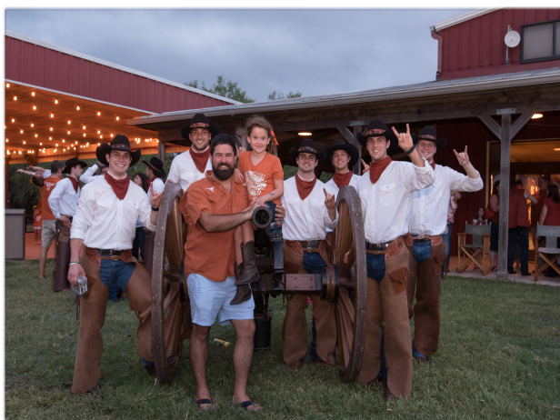
Orange and White Kickoff - August 11, 2018