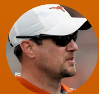
UT Football Coach Tom Herman