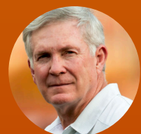
Former UT Football Coach Mack Brown